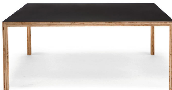
Table Caruso St John